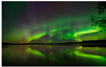
Aurora Rays by Cathy Swain