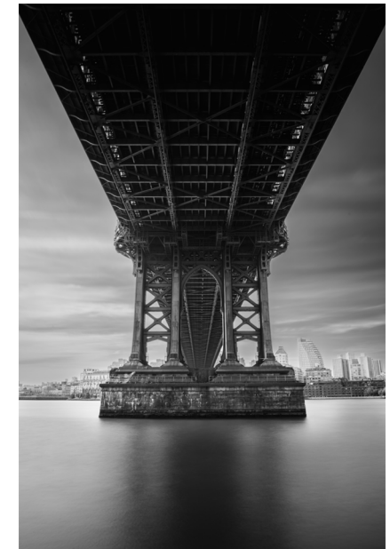
Manhattan Bridge