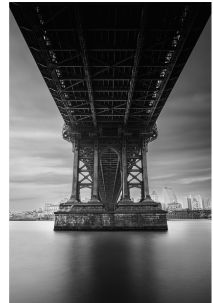
Manhattan Bridge