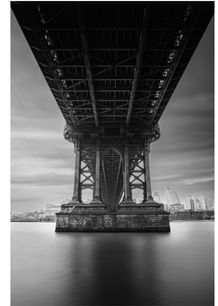
Manhattan Bridge