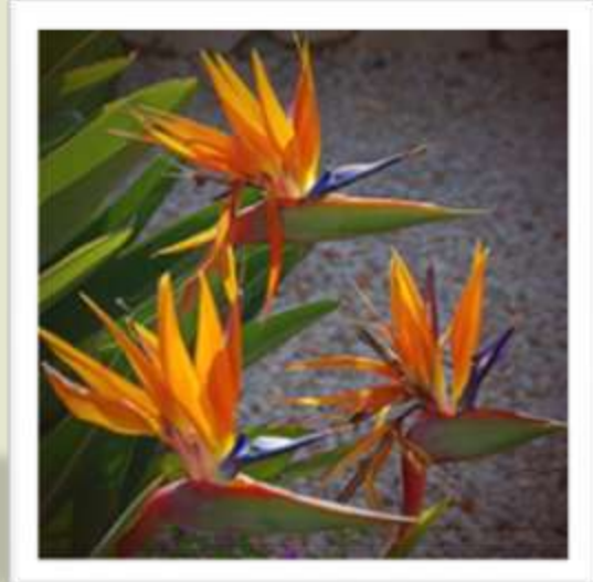
Open: "Naturally Happy" by Geddie PawlowskiHolden