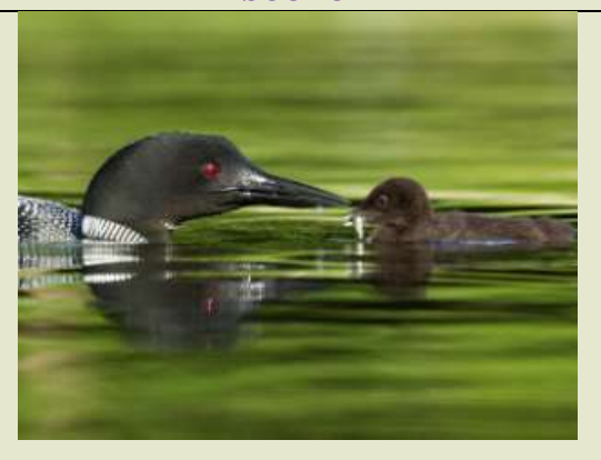
Shawn Brown Spring Feeding score