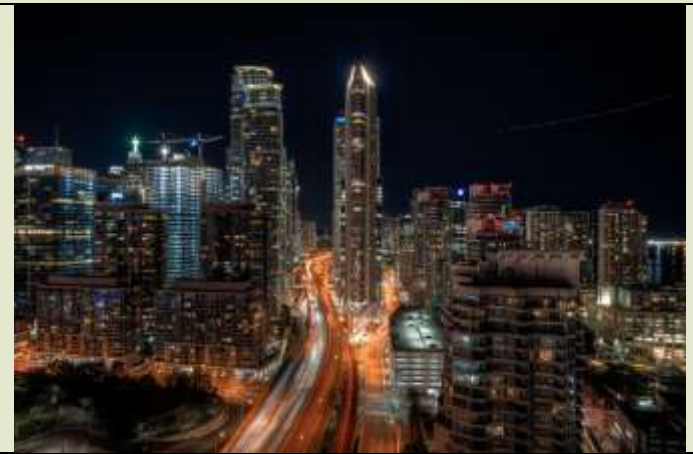
Paula Cheese Rooftop score 24