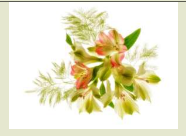
Gunter Haibach Flower score