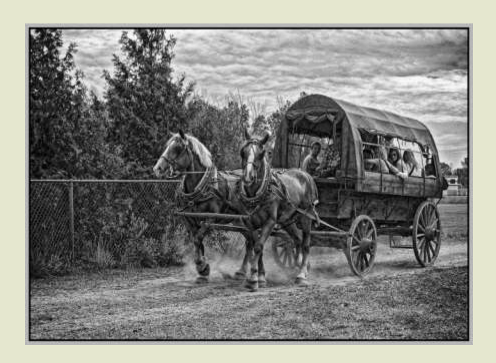
2<sup>nd</sup> place: Glenn Holden "Soldier" 3<sup>rd</sup> place Gunter Haibach "Starting Gate"