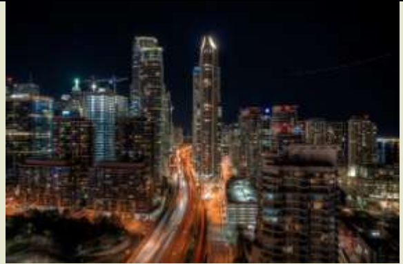
Paula Cheese Rooftop score 22 HM