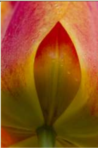
Herman Ouwersloot Rain on Tulip score 22