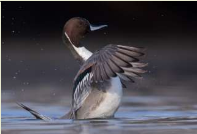
Randy Lowden Pintail score 23.5