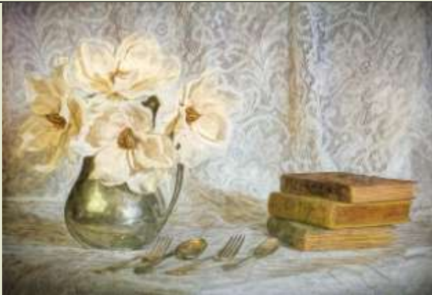
Virginia Stranaghan Flowers and Books Score: 23