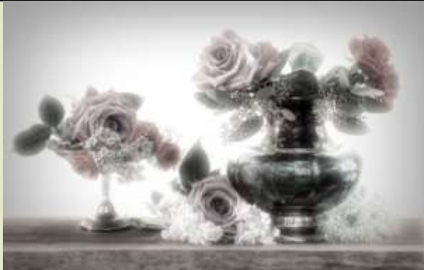
Gunter Haibach Flower Arrangement score 22