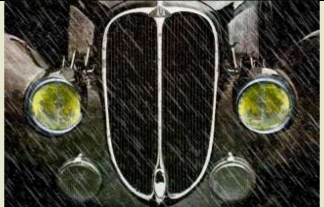
Gunter Haibach Rainy Day Score: 20.5