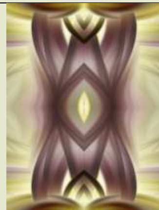
Virginia Stranaghan Symmetry in Abstraction score 21