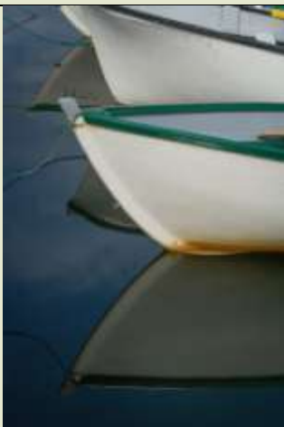
Robert Casement Boats score 20