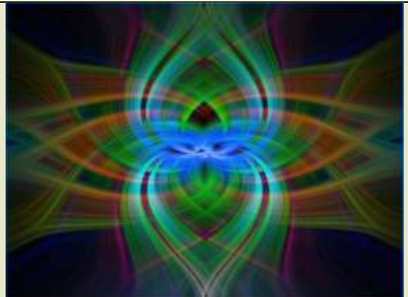
Kathy Heykoop Swirls Score: 22