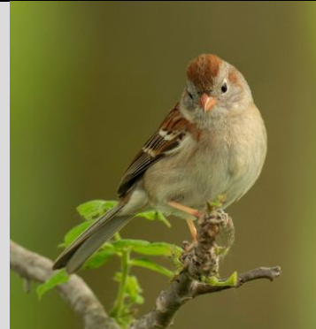
Field Sparrow Score: 24