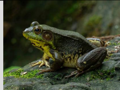
Bull Frog Score: 23