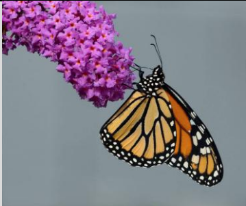
Monarch Butterfly Score 24.5