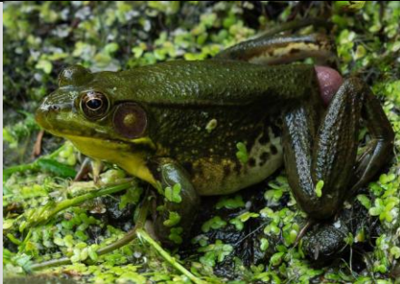
Bull Frog Resting Score:22.5