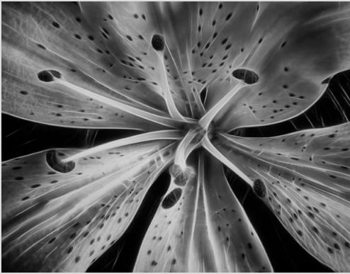
Gunter Haibach Score: 20.5