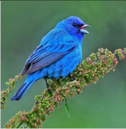
Score 22.5

CONGRATULATIONS TO OUR CLUB MEMBERS WE CAME IN 5 TH PLACE FOR THE OCTOBER 2018 NATURE COMPETITION