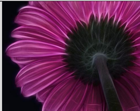
Randy Lowden Score: 21.5