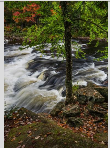
Robert Casement Score: 22

We came in 15 th out of 37 club entries with a total score of 130 Well Done Everyone!!!!