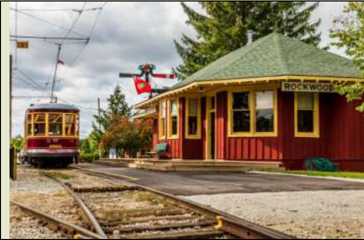
Rockwood Station